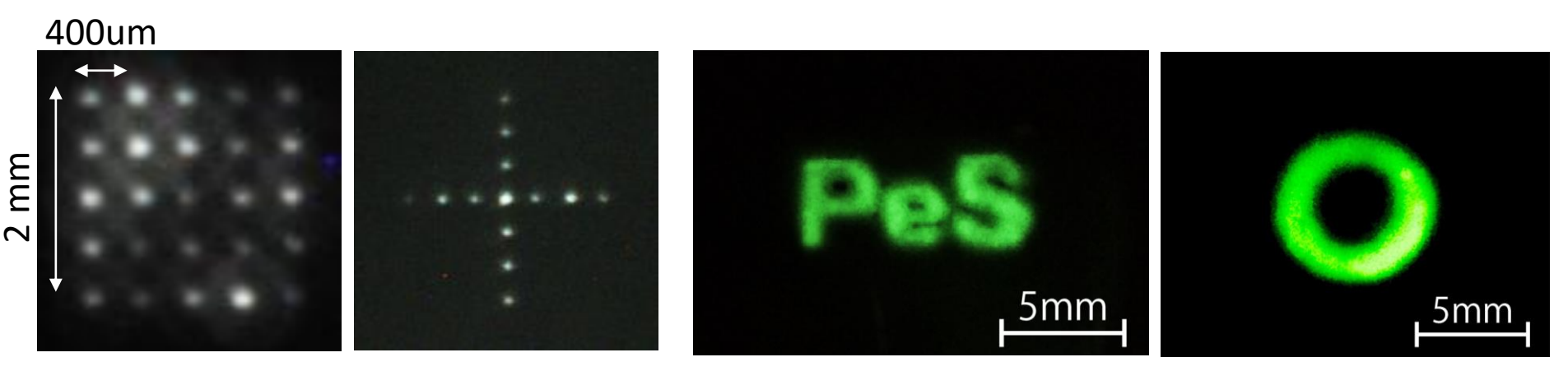
5x5 Multi (left) and Deformable (right) e- beam generation from our photocathode